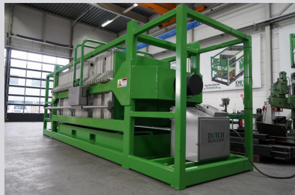
Filter Press with plate shifter

The purpose of filtering completion, workover or well bore clean up fluids is to prevent the contamination of the producing formation. Contamination reduces production and shortens the life of a producing well. Contamination of the formation with particles can occur during wellbore clean up, perforating, fracturing, acidizing, work-over, water injection, and gravel packing as well. Any time a fluid with solids is introduced into the well bore, no matter how slight, there is a chance of damaging/plugging the formation. Therefore all fluids used during completion of an oil and/or gas producing must be free of dirt particles.